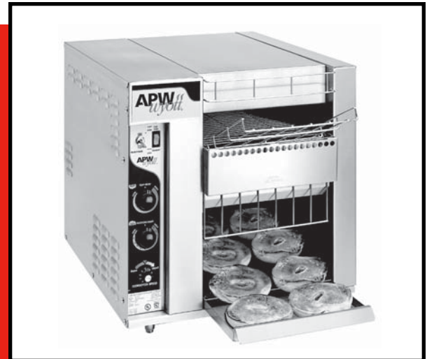
MODEL BT-15-2 CONVEYOR TOASTER